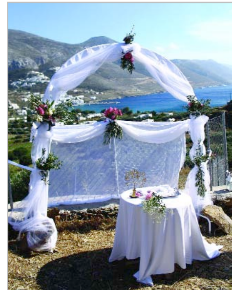
A pretty arch and sea view for this ceremony setting