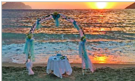
Beach weddings can be organised at Aegialis Hotel & Spa