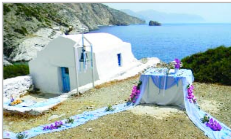
A chance to say "I do" by this picturesque little chapel